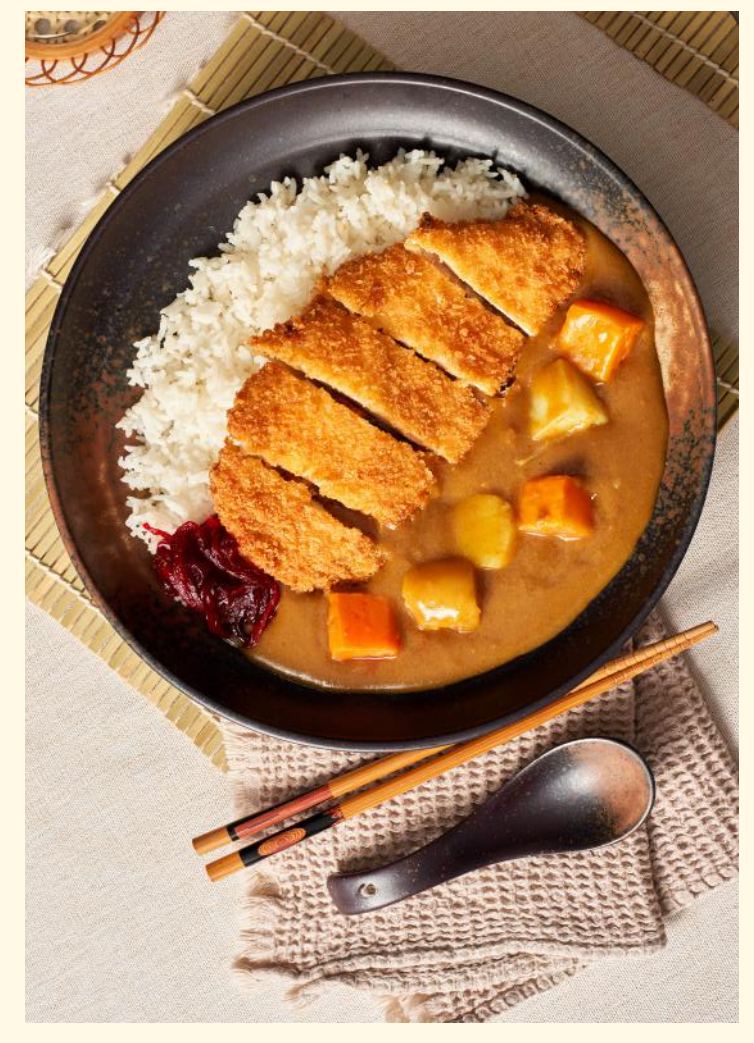
Pork Katsu Set