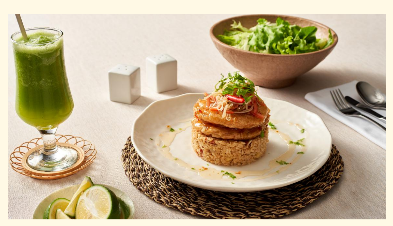
Thai Glazed Fish with Khao Pad Sapparot