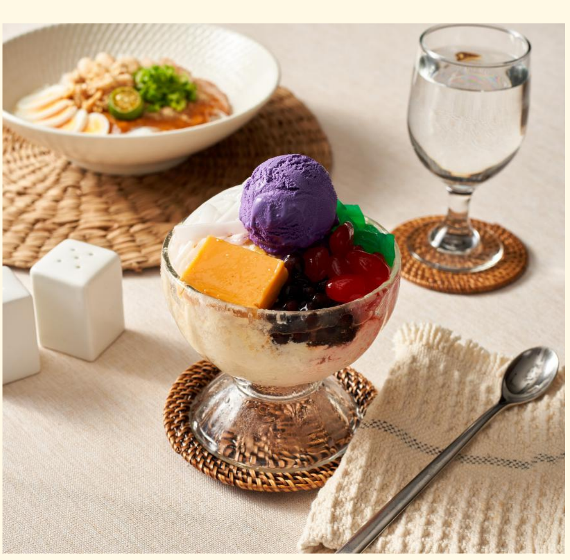
Two Seasons Halo-Halo