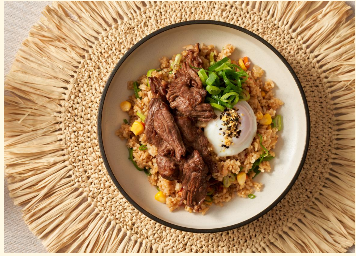
Steak-Topped Fried Rice